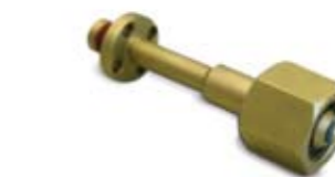
132009 CO 2 cylinder adapter (ISO5145 standard)