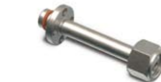
132008 N 2 O cylinder adapter (ISO5145 standard)