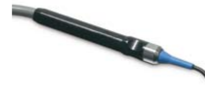
133001 Cryo probe for cataract