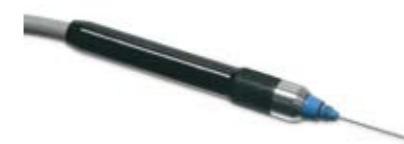
133007 Cryo probe, endovitrear