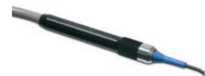
133006 Cryo probe for glaucoma