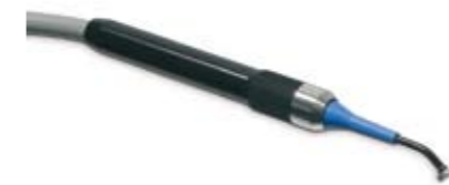
133004 Cryo probe for retina, "T" shaped