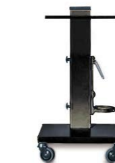
183001 Trolley for Cryoline with cylinder holder