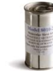
132005 Spare cartridge for gas filter