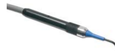
133003 Cryo probe for retina, spatula