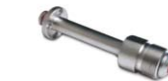
132010 N 2 O cylinder adapter (French standard)