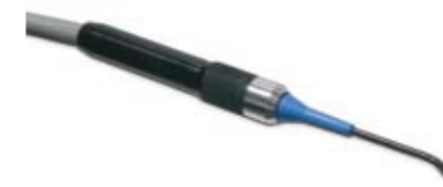
133005 Cryo probe for retina, "Bonnet"