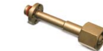
132006 CO 2 cylinder adapter (Chinese standard)