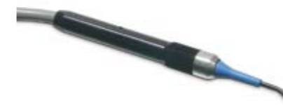
133002 Cryo probe for retina, ball